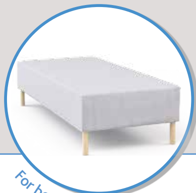
For box mattresses