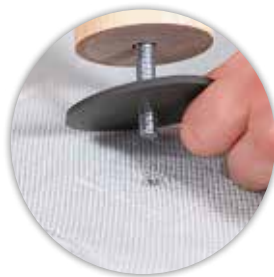
Tight lead-throughs for legs