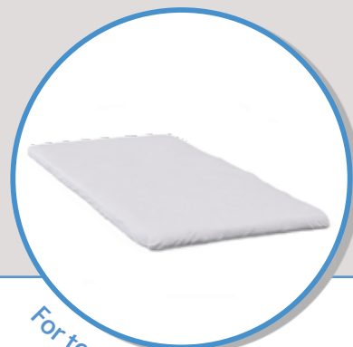
For top mattresses