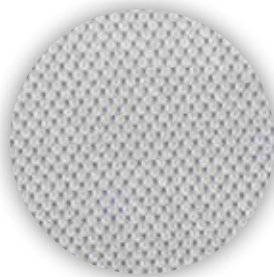
Protective, bedbug-proof fabric. Both breathable and washable