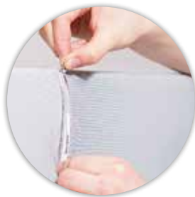
Zipper solution that forms a seal