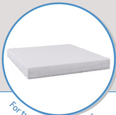
For turnable mattresses