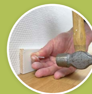
Nail in place. Finished.

Our prefabricated bed bug skirting boards are delivered ready-to-use with the active substance folded into a paper strip on the inside of the skirting board. During installation, the carpenter folds up one part of the paper strip and then nails the skirting board onto the wall in the usual way.